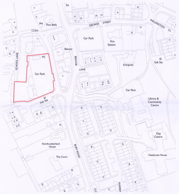
Site Location scale 1:1,250